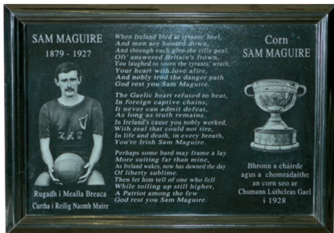
Centrepiece of Sam Maguire Wall